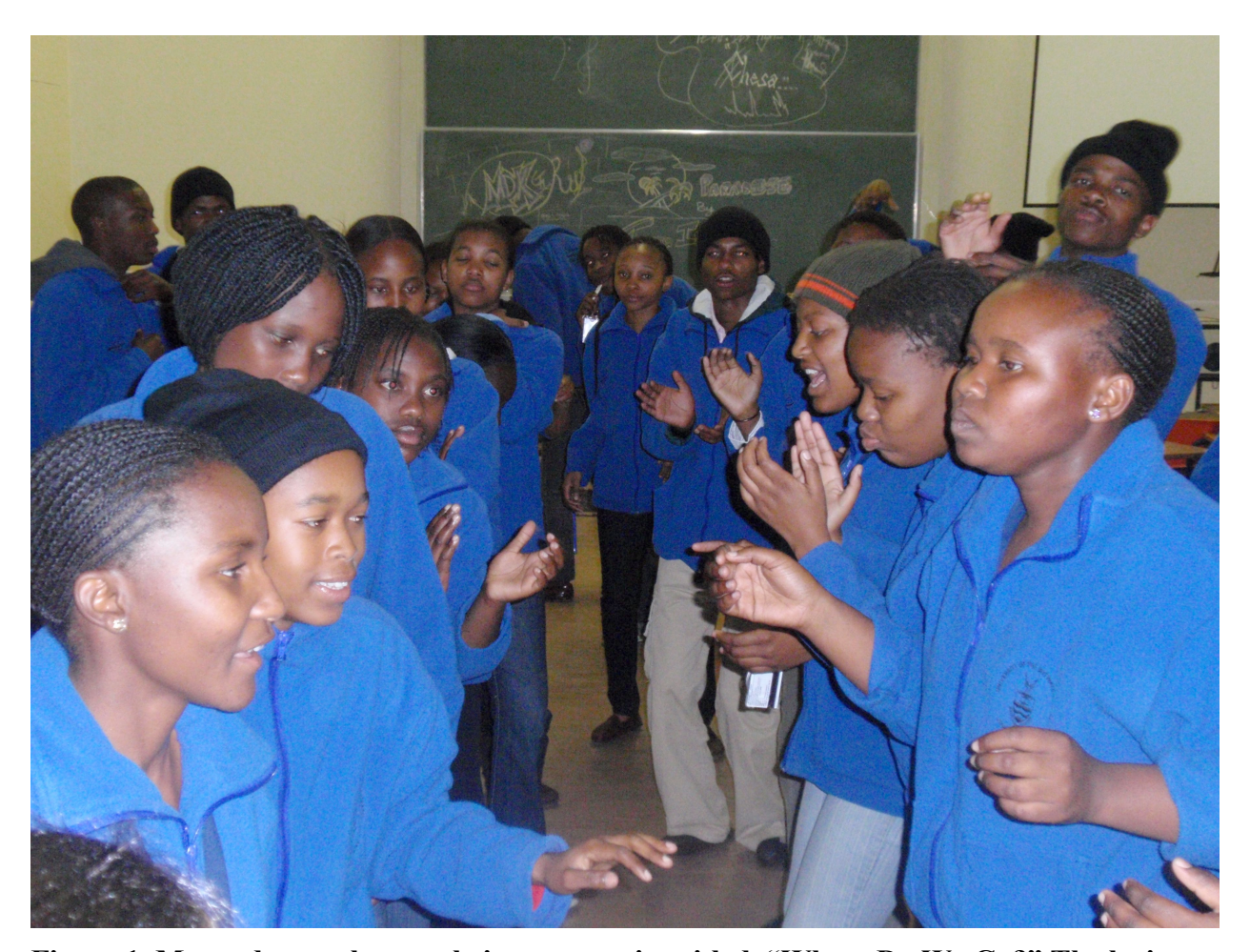
Figure 1. My students rehearse their presentation titled, "Where Do We Go?" The lyrics are reproduced below.

Where do we go? A Sxaxambishi (Focus) Production