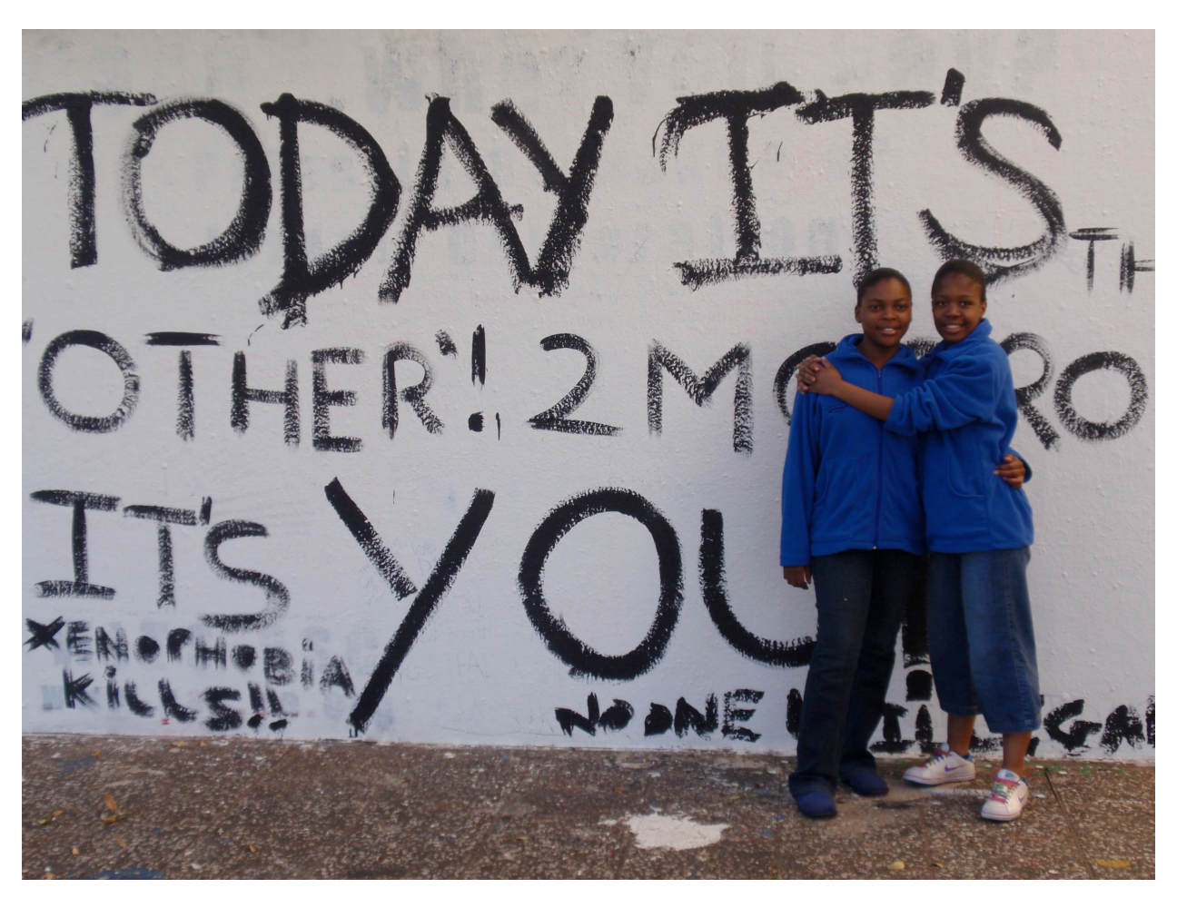
Figure 3. Two of our learners noticed a timely demonstration against xenophobic violence in South Africa.