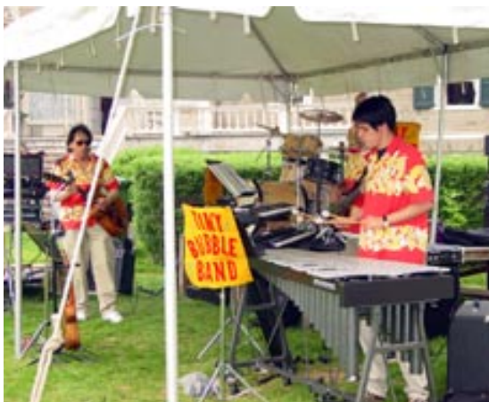
The Tiny Bubble Band creates a festive island atmosphere.