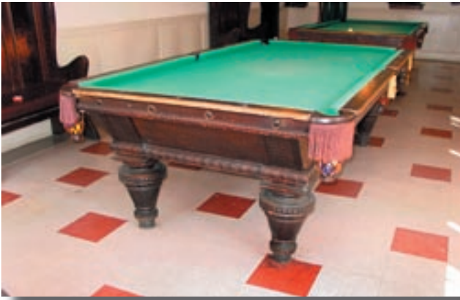
Pool Tables circa 1890's before restoration.