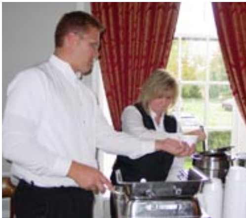
Spicy Cajun Seafood Gumbo was a big hit at the reception, especially on a cold day!

It occurred to us before the party, however, that whenever we host these events, we have no idea afterwards how many Charter alums enjoyed the festivities at the reception, let alone who was there. We decided this year we would try something new to help us keep better track, so we set up a check-in table. This new procedure served several purposes. It ensured that we were truly hosting PCC members and their guests. It gave us the opportunity to chat with old friends and meet members from other class years, and it allowed us to recognize our loyal contributors with special stickers.