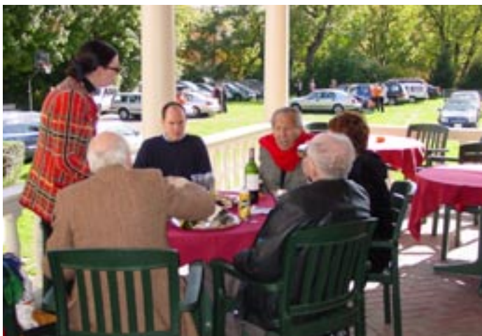
A beautiful day to chat with friends.

We received very positive feedback on the check-in procedures and about the event itself from those present. Approximately 56 Charter members attended the event. With their guests included, we hosted over 200 partygoers. With our new procedure in place, we are able to tell you that the