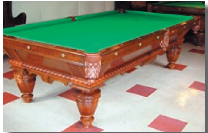
Pool tables restored to their original splendor in 2004.