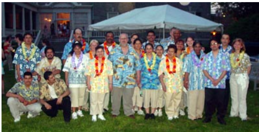
Charter Club Staff put together a fantastic Hawaiian Luau at spring house parties.